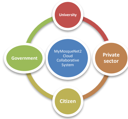
Figure 1: QHM for MyMosqueNet2Cloud Collaborative System